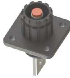
黑色板端公头 LD-ES6-MB LD-ES6 Male Connector:Black