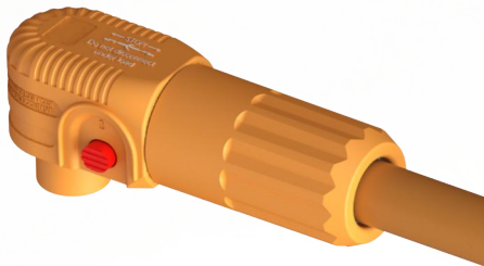
橙色线端 L 母头 LD-ES6-FO LD-ES6 Female L-Connector:Orange