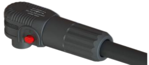
黑色线端 L 母头 LD-ES6-FB LD-ES6 Female L-Connector:Black